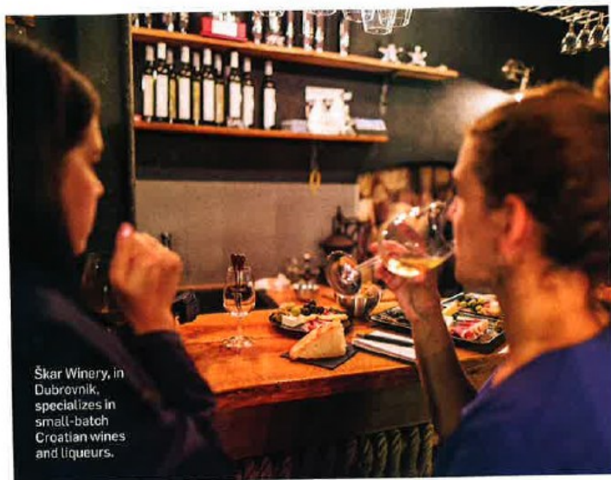
Škar Winery, in Dubrovnik, specializes in small-batch Croatian wines and liqueurs.

ad for the European lifestyle: muscular young men in bright Speedos horsed around in the shallows; tan kids dripping salt water climbed onto natural rock ledges before launching themselves back into the sea. Though the late Thursday sun was sinking behind us, no one showed any intention of leaving. I made long, leisurely trajectories across the bay for maybe 15 minutes before I mentally began drafting this